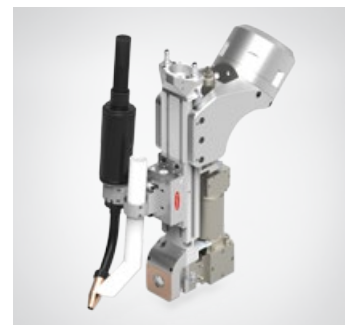
10 KW FILLET WELDING HEAD