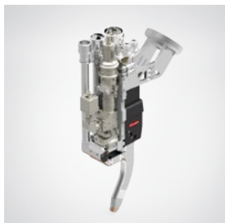
6 KW ULTRAKOMPACT TWIN