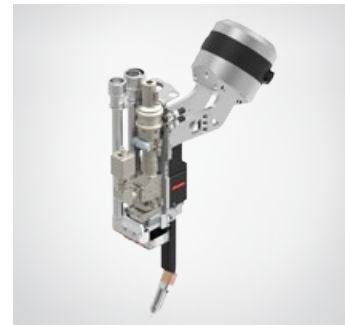
4 KW / 6 KW ULTRAKOMPACT