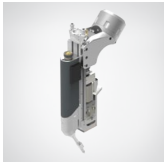
10 KW TPS/i WELDING HEAD