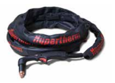
Leather torch sheathing

Available in 7,6 m sections, this option provides additional protection for torch leads against burn-through and abrasion.