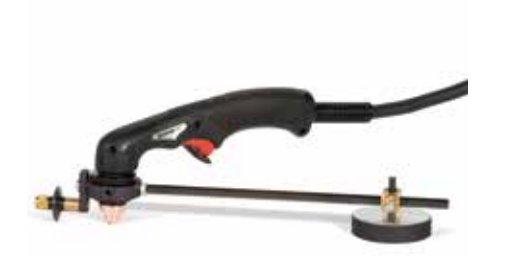
Hyamp™ deluxe circle cutting guide

Quick and easy setup for accurate circles up to 70 cm diameter. For use with the Powermax125<sup>®</sup>.