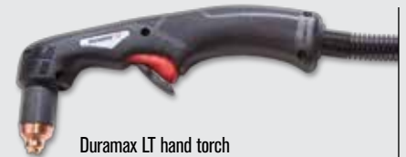
Duramax LT hand torch